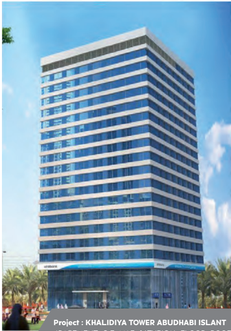
Project : KHALIDIYA TOWER ABUDHABI ISLANT 4BASEMENT+G.F+MAZ+16TYPICAL FLOOR+ROOF