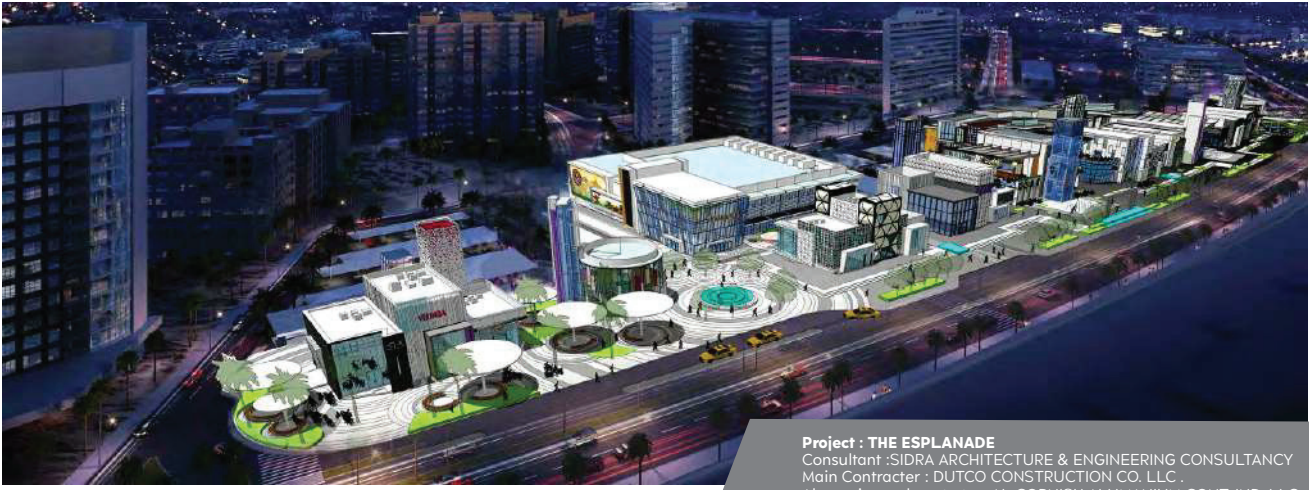
Project : THE ESPLANADE Consultant :SIDRA ARCHITECTURE & ENGINEERING CONSULTANCY Main Contractor : DUTCO CONSTRUCTION CO. LLC . Aluminium subcontractor: AL CORNISH ALUMANIUM CONT. IND. LLC