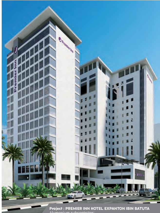
Project : PREMIER INN HOTEL EXPANTON IBIN BATUTA Alumanium subcontractor: NATIONAL ALUMANIUM EXTRUTION CO. LLC