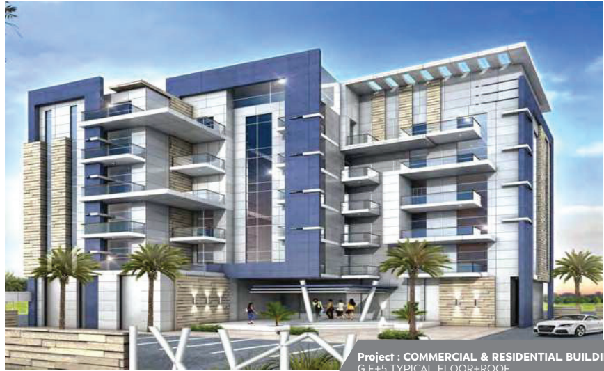
Project : COMMERCIAL & RESIDENTIAL BUILDING G,F+5 TYPICAL FLOOR+ROOF Aluminium subcontractor: BAWBAT AL SHUROOQ