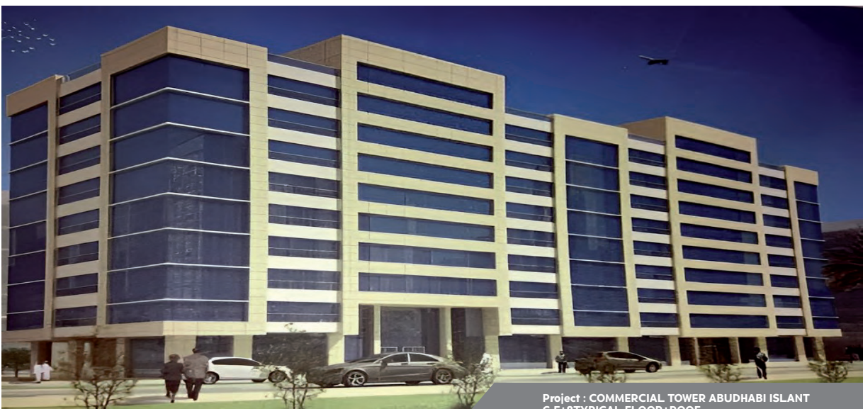
Project : COMMERCIAL TOWER ABUDHABI ISLAND G,F+8 TYPICAL FLOOR+ROOF Aluminum subcontractor: BAWBAT AL SHUROOQ