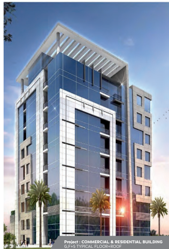
Project : COMMERCIAL & RESIDENTIAL BUILDING G,F+5 TYPICAL FLOOR+ROOF Alumanium subcontractor: BAWBAT AL SHUROOQ