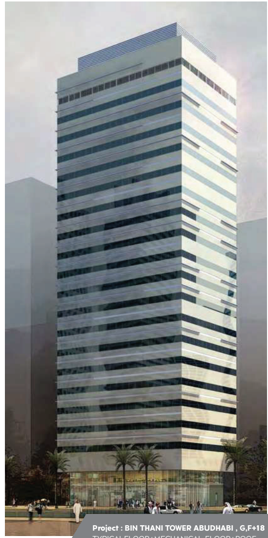
Project : BIN THANI TOWER ABUDHABI , G,F+18 TYPICAL FLOOR+MECHANICAL FLOOR+ROOF