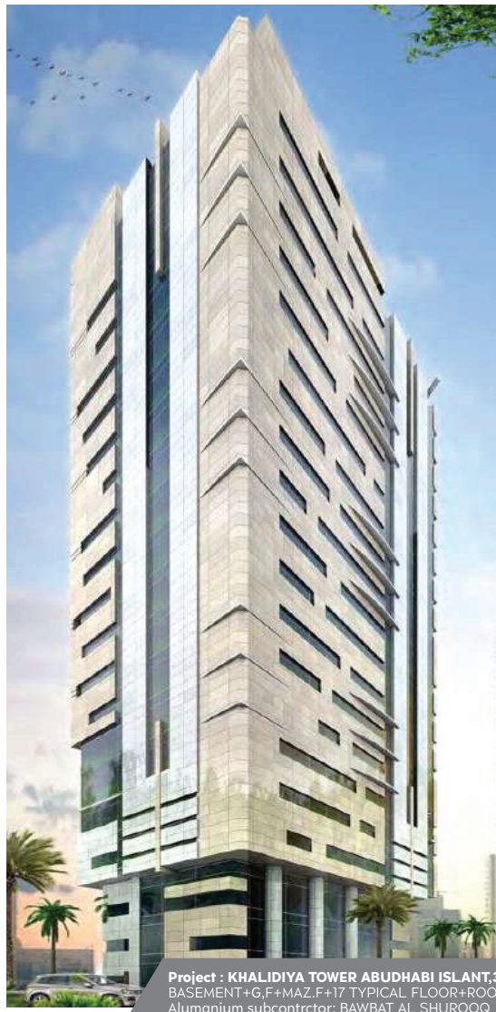
Project : KHALIDIYA TOWER ABUDHABI ISLAND,3 BASEMENT+G,+F+MAZ,+F+17 TYPICAL FLOOR+ROOF Aluminium subcontractor: BAWBAT AL SHUROOQ