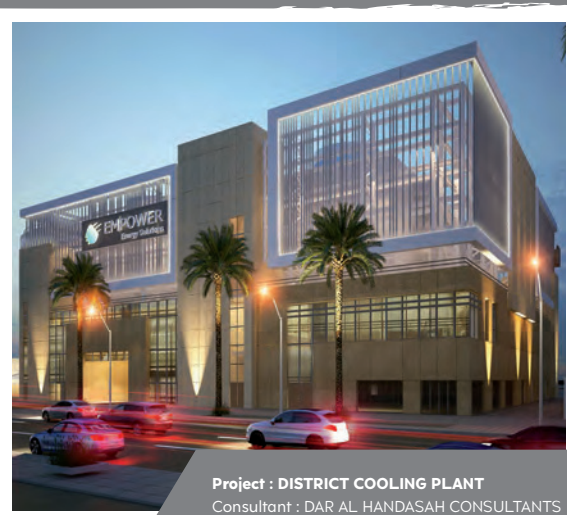
Project : DISTRICT COOLING PLANT Consultant : DAR AL HANDASAH CONSULTANTS