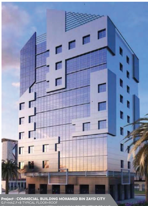
Project : COMMECIAL BUILDING MOHAMED BIN ZAYD CITY G,F+MAZ,F+8 TYPICAL FLOOR+ROOF Alumanium subcontractor: AL JASSIM ALUMINIUM CONTRACTING CO. LLC.