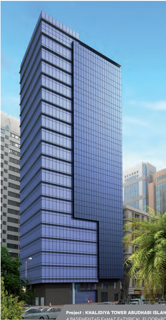
Project : KHALIDIYA TOWER ABUDHABI ISLANT 4 BASEMENT+G,F+MAZ.F+TYPICAL FLOOR+ROOF