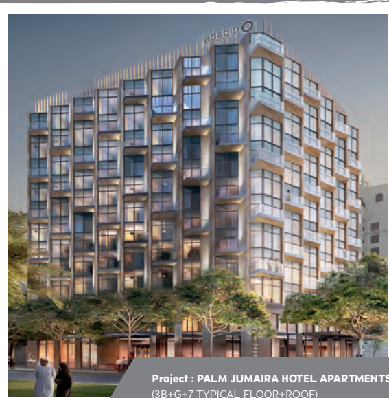
Project : PALM JUMAIRA HOTEL APARTMENTS (3B+G+7 TYPICAL FLOOR+ROOF)