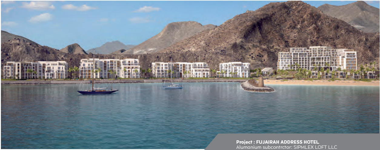
Project : FUJAIRAH ADDRESS HOTEL Aluminum subcontractor: SIPMLEX LOFT LLC