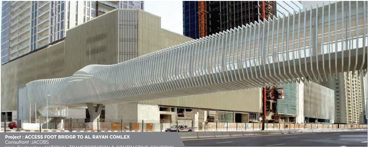
Project : ACCESS FOOT BRIDGR TO AL RAYAN COMLEX Consultant : JACOBS Main Contractor : NATIONAL TRANSPORTATION & CONTRACTING COMPANY . Alumanium subcontractor: SIPMLEX LOFT LLC