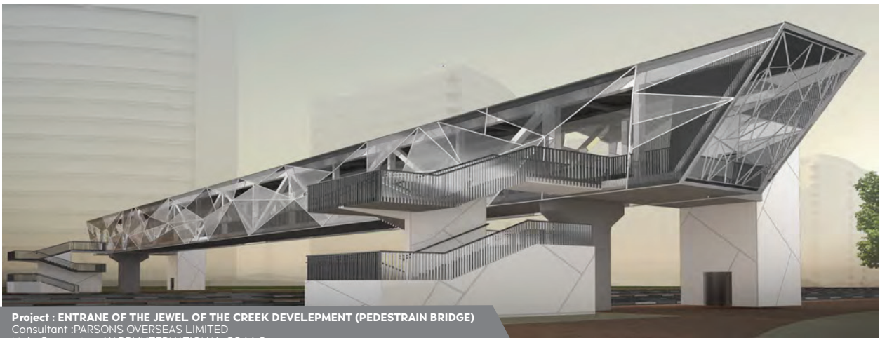
Project : ENTRANE OF THE JEWEL OF THE CREEK DEVELOPMENT (PEDESTRAIN BRIDGE) Consultant : PARSONS OVERSEAS LIMITED Main Contractor : KABRI INTERNATIONAL CO LLC . Alumanium subcontractor: ALUMETAL