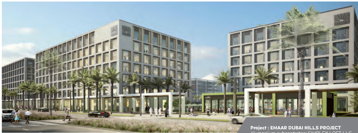
Project : EMAAR DUBAI HILLS PROJECT Aluminium subcontractor: SIMPLEX LOFT LLC